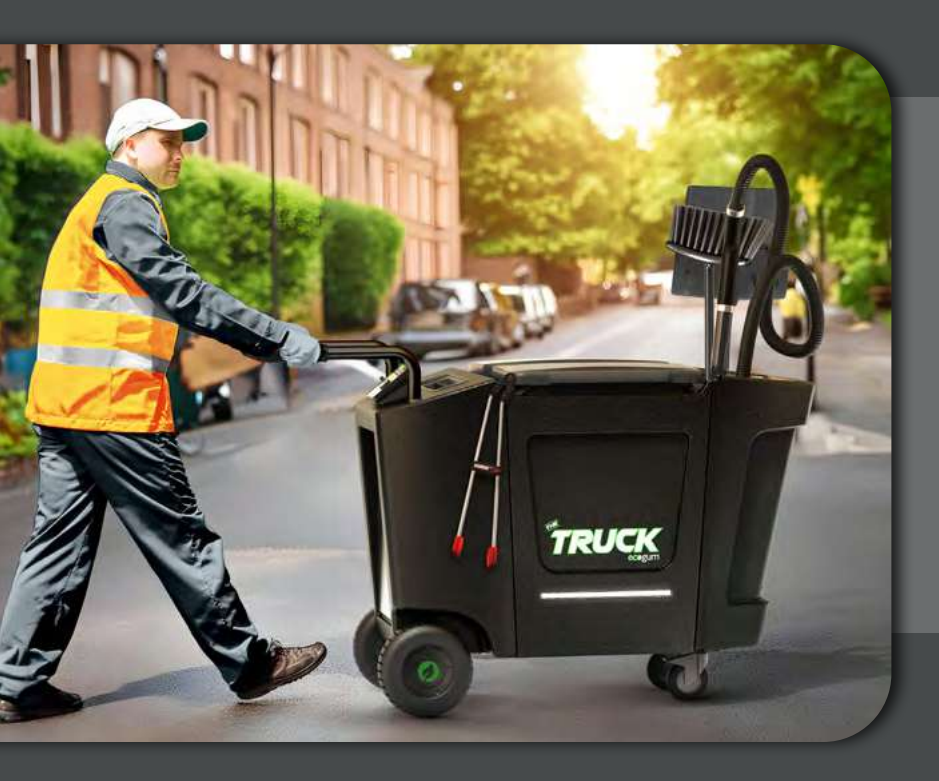
Dual-control panel for full control of the Truck and gum remover

The Ecogum Truck is here to tackle some of the toughest cleaning challenges in public and shared spaces. Designed with the operator in mind, the Truck will help make light work of removing litter, chewing gum, stickers and graffiti tags.